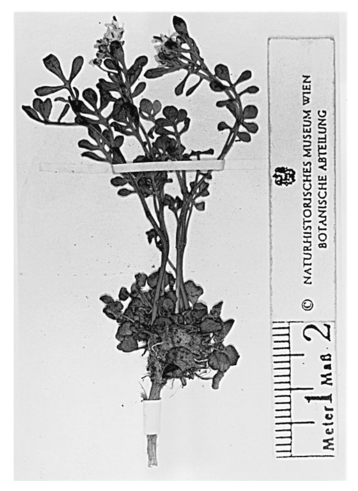
Figure 3. The epitype of Cardamine resedifolia L., W (Photograph by courtesy of the Museum of Natural History, Vienna, G. Oppel).

There are two references to illustrations in the protologue. The first of them is in Bauhin's Prodromus theatri botanici (Bauhin, 1620: 45). The plant depicted here seems to be C. resedifolia , however it lacks a very important identification character, namely auriculate bases to the leaves and thus could be misidentified with Cardamine glauca Spreng. Probably this was the source of the distributional information in Species plantarum , as Bauhin (1620: 45) wrote "... Helvetiorum alpibus & Pyrenaeis". The other illustration which is referred to in the protologue is that of Boccone in his Museo di piante rare della Sicilia (Boccone, 1697: 51 [the correct page reference is 51 not 41 as printed in Species plantarum ]). The plant depicted here captioned as "Nasturtium alpinum, Rhesedae folio" most probably belongs to C. resedifolia , but the illustration is very poor and again lacking the auriculate leaf-bases. There is no herbarium specimen in Bauhin's herbarium in Basel (BAS) (Dr H. Schneider, pers. comm.) and