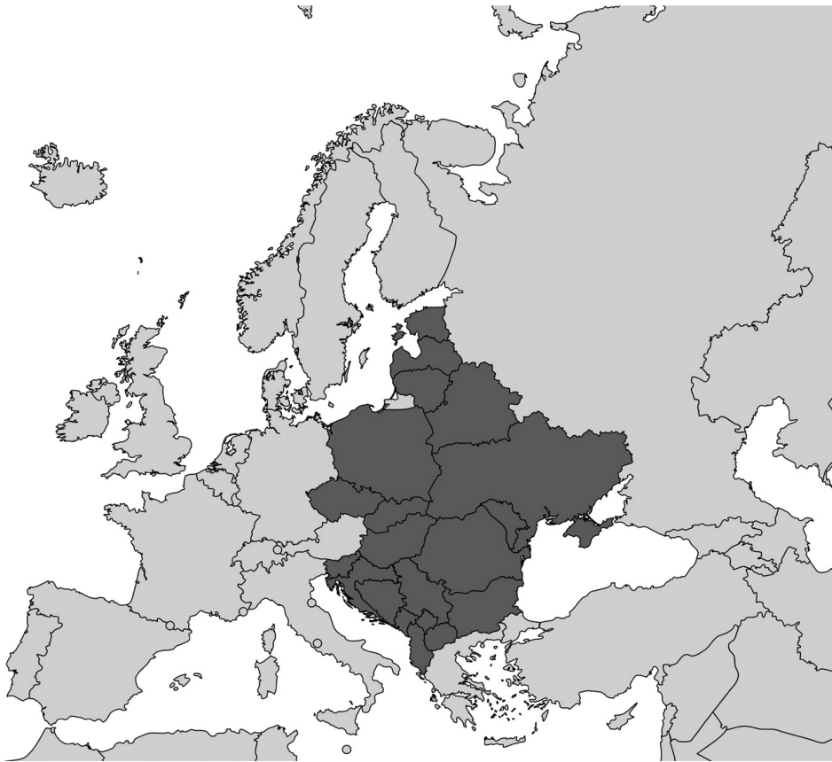
Fig. 4.1 Delimitation of the Eastern European socio-economic region as used in this chapter. The map was created by using MapChart ( https://mapchart.net/ ).

northern part of the Baltic countries in the Boreal zone (BOR) is covered with coniferous forests (taiga). Most parts of the Baltic countries, some regions of Poland, Ukraine and Belarus falls into the Nemoral zone (NEM) with primary deciduous and mixed forests, wetlands and bog mosaics. The lowland and foothill regions of the Carpathian basin, the Middle and Lower-Danube Plains and the Black-Sea Lowland is within the Pannonian-Pontic environmental zone (PAN) and characterized by natural forest-steppe and steppe vegetation. The highest altitudes of the Carpathian and the Balkan mountains are in the Alpine South Environmental Zone (ALS) and home to heathland and alpine grassland vegetation. The low and medium mountains of the northern Balkans with an increased Mediterranean influence form the Mediterranean Mountains Environmental Zone (MDM), where the potential vegetation is Mediterranean evergreen forests and beech forests, but which are now mostly covered with overgrazed pastures and grasslands.