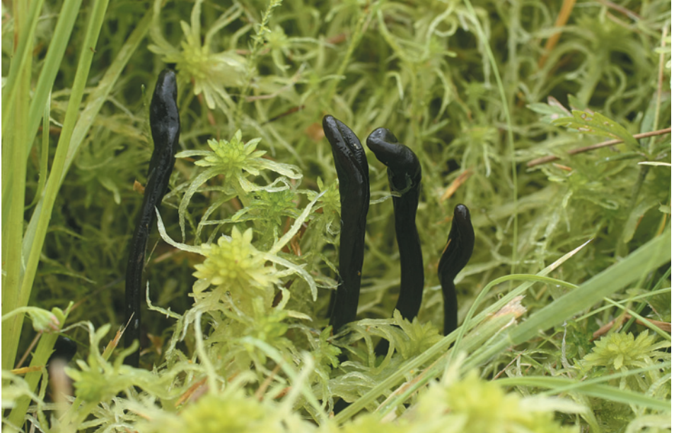
Fig. 3. Geoglossum uliginosum , Czech Republic, Jizerské hory Mts., Malá Strana, 10 Aug. 2011, leg. V. Kučera, J. Gaisler, V. Kautman (SAV 10531). Photo J. Gaisler.

Fig. 2. Geoglossum uliginosum , Czech Republic, Jizerské hory Mts., Malá Strana, 7 Aug. 2011. Photo J. Gaisler.