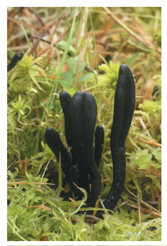
Fig. 2. Geoglossum uliginosum , Czech Republic, Jizerské hory Mts., Malá Strana, 7 Aug. 2011.